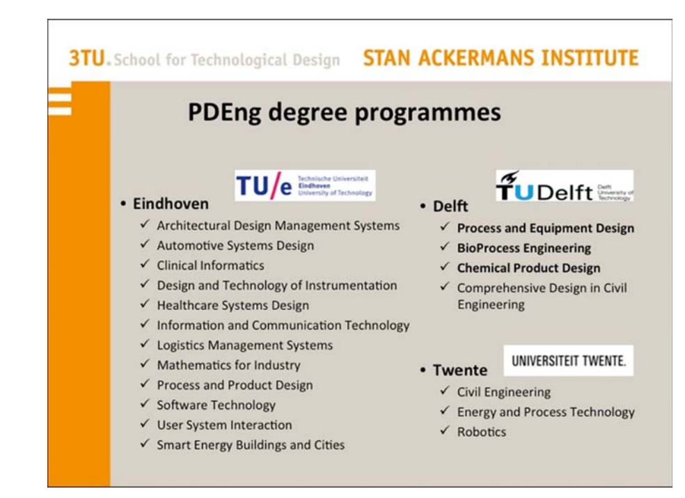
Figure 2. Overview of current post-MSc PDEng designer programmes (traineeships) at the three universities of technology in the Netherlands.

In Figure 2 the current PDEng programmes (traineeships) offered at the three technical universities in the Netherlands are listed. In this paragraph the general content of these programmes is discussed, whereas in the next paragraph as an example the contents of the TU Delft traineeships in the fields of (bio)chemical engineering will be discussed in more detail.